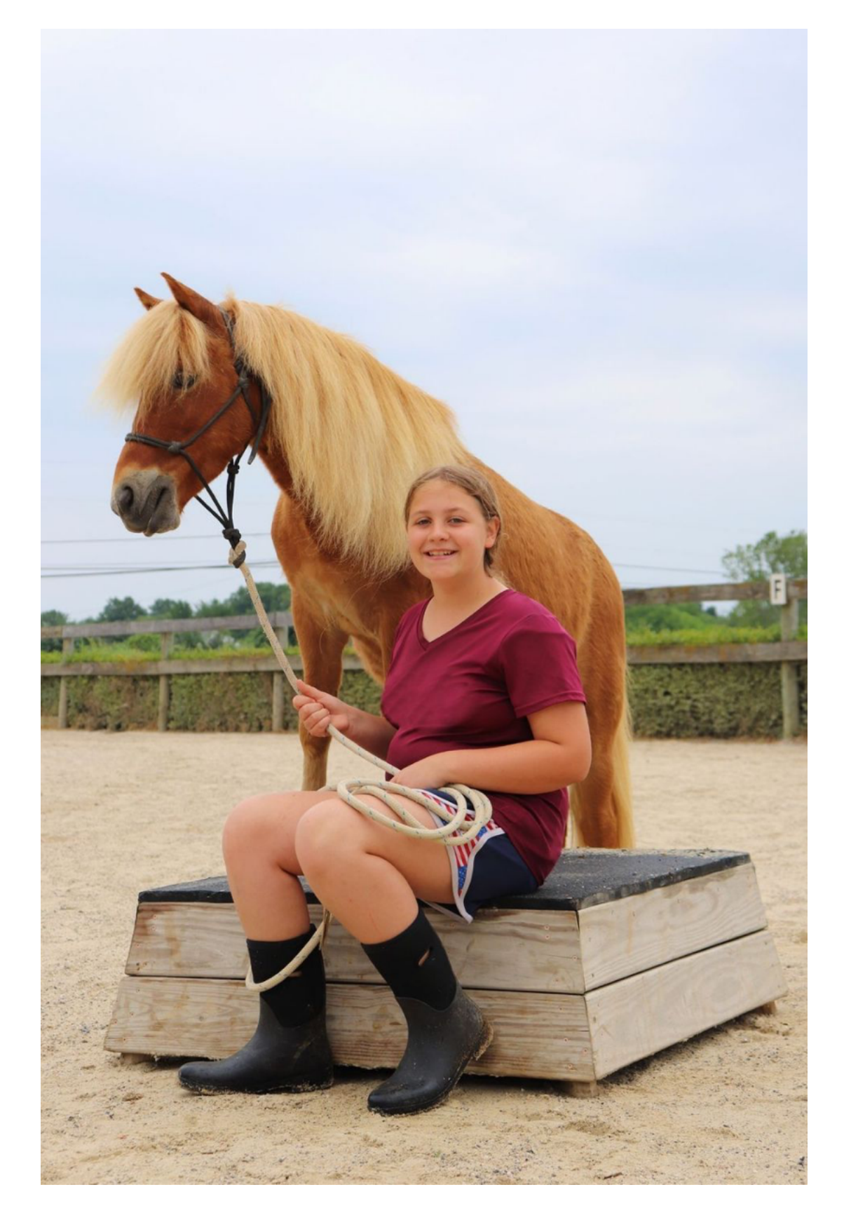
13-year-old Pony Cross gelding, 10.2hh

Obadiah is a handsome pony with a big step and beautiful locks. This gelding would make a fantastic driving pony or companion and also has experience with groundwork, obstacle work, and liberty work. Obadiah can be a little shy, so he will need a quiet handler that will help grow his confidence. Obadiah is currently turned out with mares, geldings, and donkeys and is quiet in the group—he is often seen snoozing in the sunshine!